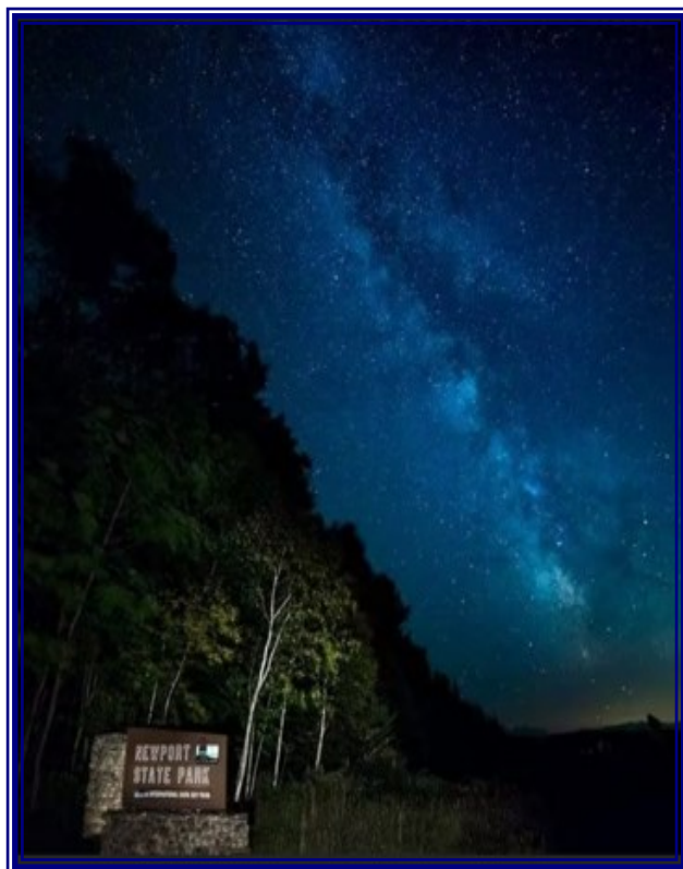
Officially designated "dark sky" park.

It is with great pleasure that the Thumbs Up Riders of Door County equestrian club is heading up, in conjunction with the DNR and the Newport State Park Land Manager, the installation of 6 miles of looping equestrian trails in the park. All the hard work over many years from club members has paid off. Finally, equestrians will have a designated public trail system here in beautiful Door County! This will be a day use, single track sustainable trail with an equestrian parking lot accommodating 4 to 6 rigs. We plan on installing a kiosk that will display a large overview map and user information with additional maps for user's convenience. Markings at intersections will coincide with map directions. We are in the final stage of design/mapping approval and plan on beginning to build the trail this summer.